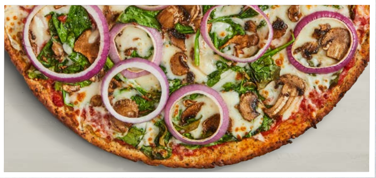
CAULIFLOWER GRUST* This vegan and grain-free crackerlike crust is big on flavor with fewer carbs than our large sized thin crust.